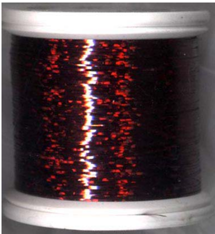
Jewel Madeira 515 Ruby Red