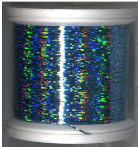
Jewel Madeira Aqua 533 The shinny centerline is the original color