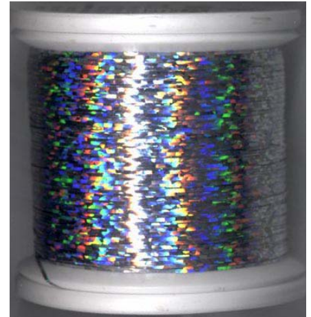
Jewel Madeira Silver 542