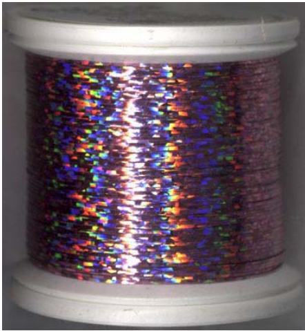
Jewel Madeira 513 Pink that is down the center is the main color

Jewel Madeira Threads 100 meters each spool. Jewel Madeira is a special holographic foil, which will really give your work a SPARKLE! Stitches reflect the lights around them to create a shimmering spectrum of multi-colored thread work. The color reflections are true hologram pinpoints laid in a continuous, random fashion on a micro-thin polyester film. Exposed to light, this thread sparkles and shimmers perfect for hand and machine appliqué, embroidery, quilting, and topstitching. The colors are VERY hard to get pictured for you. The center shinny strip is the color that is the most accurate representation of the color.